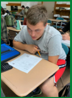
All students recognized in the student spotlight receive a free meal from Sierra Energy/Squeeze Burger.