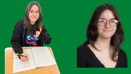
All students recognized in the student spotlight receive a free meal from Sierra Energy/Squeeze Burger.