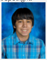
All students recognized in the student spotlight receive a free meal from Sierra Energy